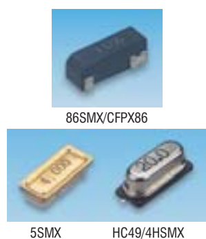
A range of quality surface mount crystals.